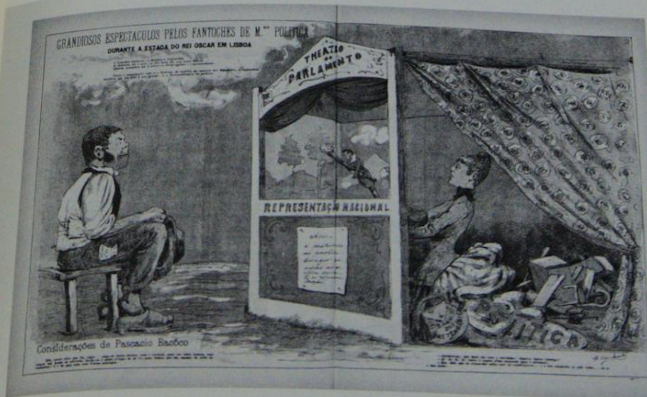
2 Grandiosos espectáculos pelos fantoches de M. Política (1888)

Encontrei através da Ilustração portuguesa de 1917, estas vinhetas ilustradas, nada me diriam não fora a belíssima imagem que agora partilho convosco que se afigura um extraordinário documento.